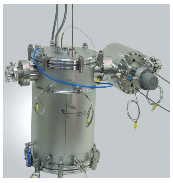
Production scale valved selenium source PVSS-9600

The VSCS is a valved selenium cracker, employed in high efficiency CIGS solar cell growth and other II-VI semiconductor material deposition applications.