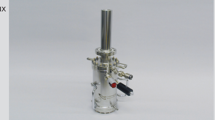
Valved Selenium Cracking Source VSCS-300 with 300 \rm cm^3 crucible and DN63CF (0.D. 4.5") mounting flange

Selenium beam pressure is generated in a heated large capacity crucible. The flow rate of Se is controlled and switched on/off by a specially designed Se-resistant valve whose outlet opens into an injection tube that includes an independently heated cracking zone. The temperature within the cracking zone can be adjusted to generate either uncracked or cracked selenium. The use of a beam shaping nozzle at the end of the injection tube provides excellent flux uniformity on the substrate.