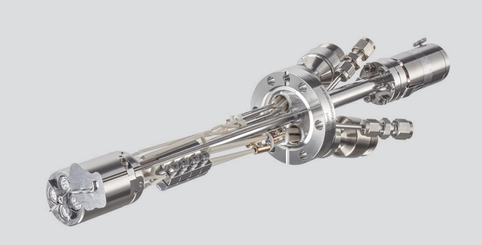
QCS 40-4x1-12-S on DN40CF (O.D. 2.75") flange