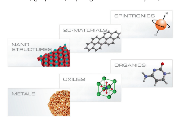
Fields of application for OCTOPLUS 300

The very compact research MBE system allows deposition of atomically thin and precisely defined layers of materials, such as metals, magnetic materials, Si, Ge, GaAs, phosphides, antimonides, nitrides, graphene, topological insulator layers, etc.