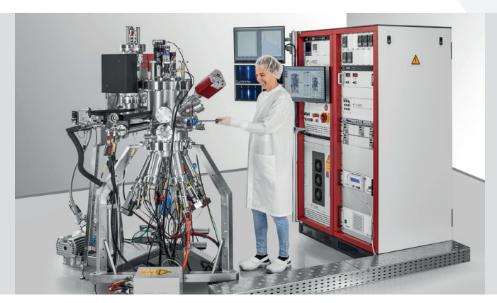
OCTOPLUS 300 MBE System

OCTOPLUS 300 is an MBE system with quite small footprint. Despite its small size it still includes the main features needed for high quality MBE layer deposition.