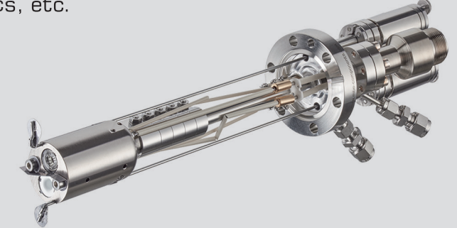
DCS 40-2x1-14-2S on DN40CF (2.75") flange