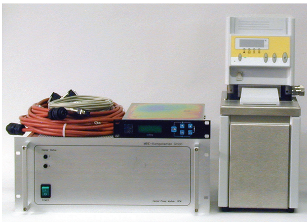
HPM power supply, controllers, cables and heating thermostat for the AKS system

An easy and safe refilling procedure is provided by the use of a removable additional reservoir. This heatable refilling unit can be filled with reactive alkali metal source material within an inert gas floated external glove box, closed tightly and be mounted to the source. Thus, "quasi in-situ refilling" of the evaporator reservoir is made possible.